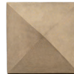
Pier Cap 26"W x 26"L x 2.5"-5.5"H