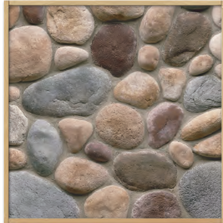
Adirondack River Rock

The distinctive and time honored shape of River Rock is easily recognizable. Soft rounded contours are slowly revealed from the gradual effects of rushing water. River Rock ranges in size from approximately 1½"-15" in height and 3"-18" in length.