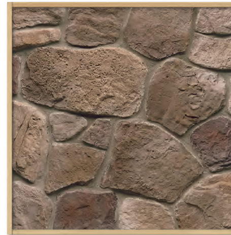
Brown Top Rock