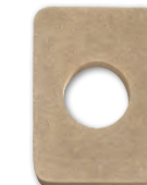
Light Box 8"W x 11"H x 1.5"D