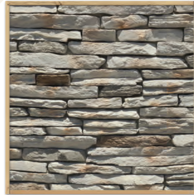
Hamilton Laurel Cavern Ledge