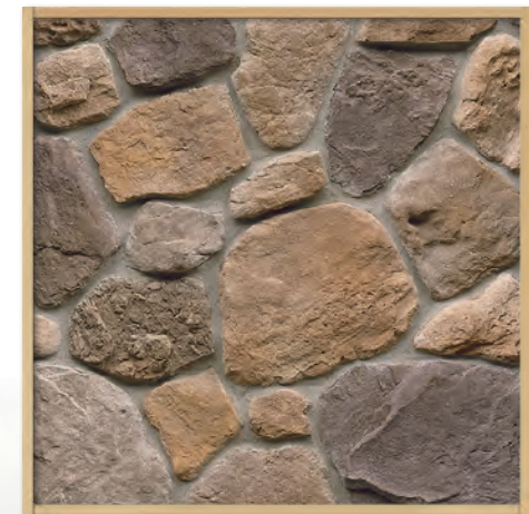
Warm Springs Top Rock