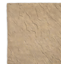
Hearthstone 19"W x 20"L x 1.5"H