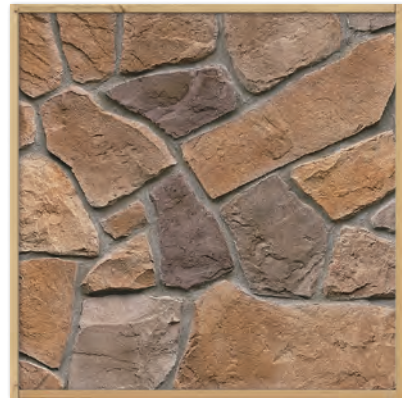
Warm Springs Fieldstone