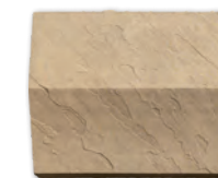
Peaked Wall Cap 20"L x 12"W x 2.375"-3.5"H 20"L x 16"W x 2"-3.5"H