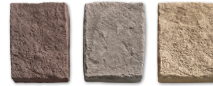
Espresso Grey Cream

StoneCraft accessories are designed to provide the finishing touch to any stone veneer application. Developed specifically to work in concert with any of our profile colors, each accessory is offered in four versatile colors.