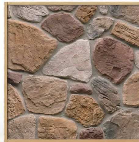
Realen Top Rock