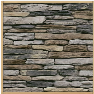
Pennsylvania Laurel Cavern Ledge