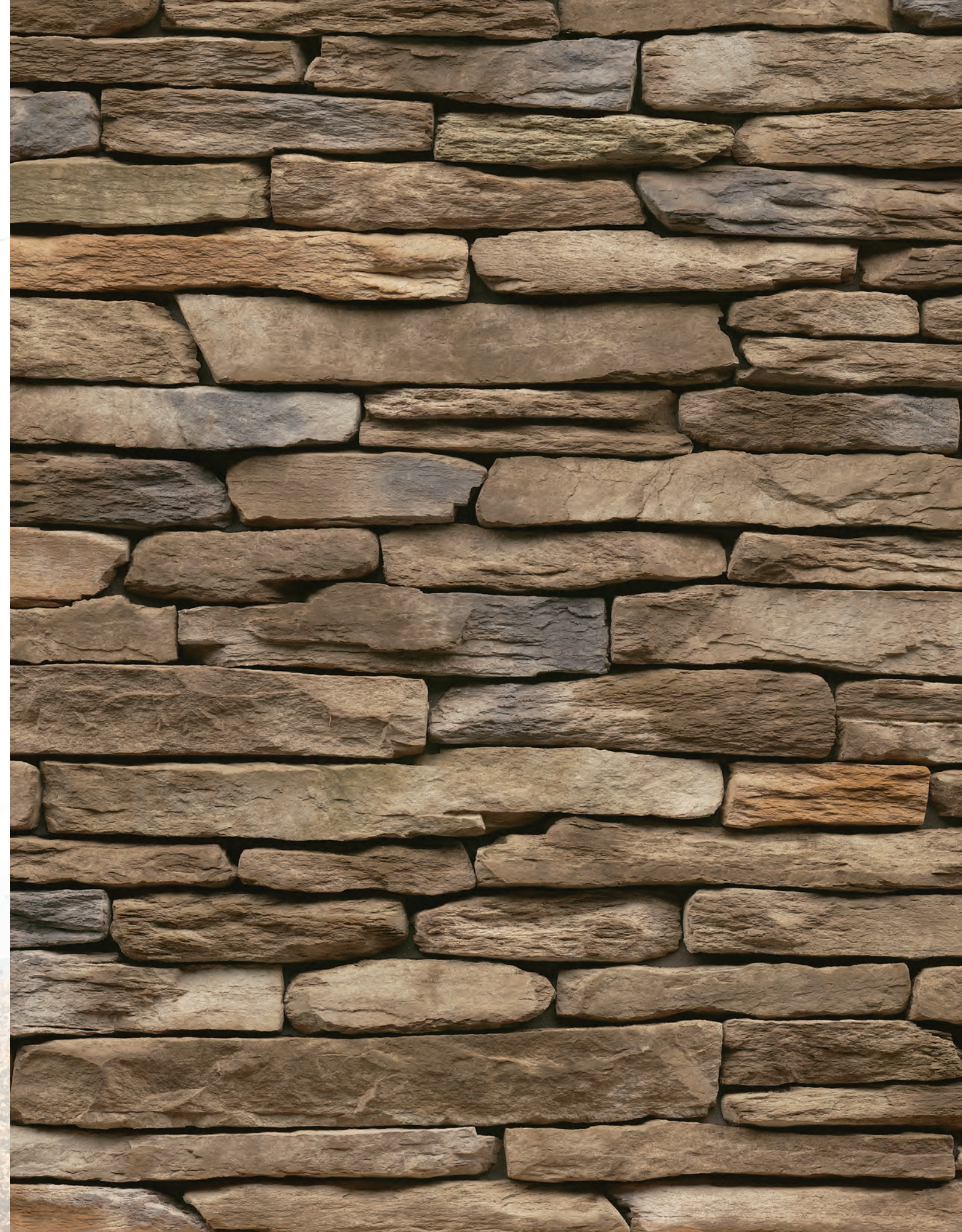
Asher Laurel Cavern Ledge