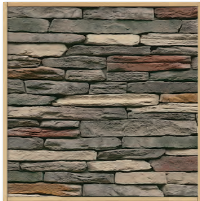
Tennessee Laurel Cavern Ledge