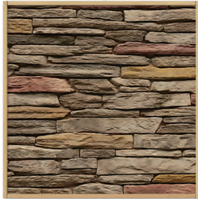
Chardonnay Laurel Cavern Ledge