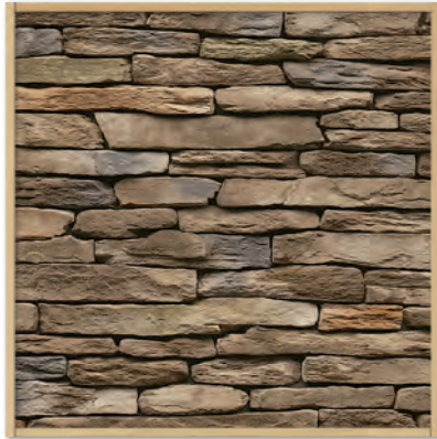
Asher Laurel Cavern Ledge