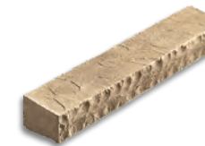
Rock Face Sill 19.75"W x 3"D x 2"H (FACE) TO 2.5"H (BACK)