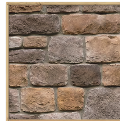
Warm Springs Heritage