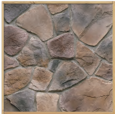
Valley Forge Fieldstone