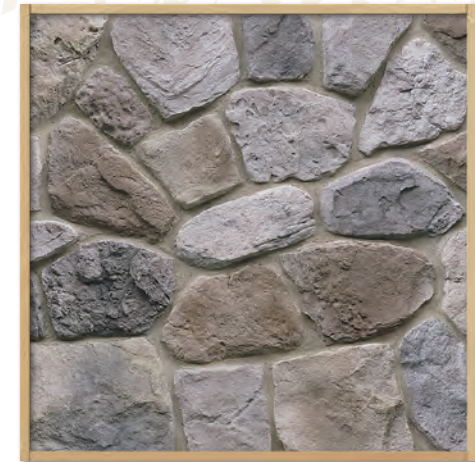
Pennsylvania Top Rock