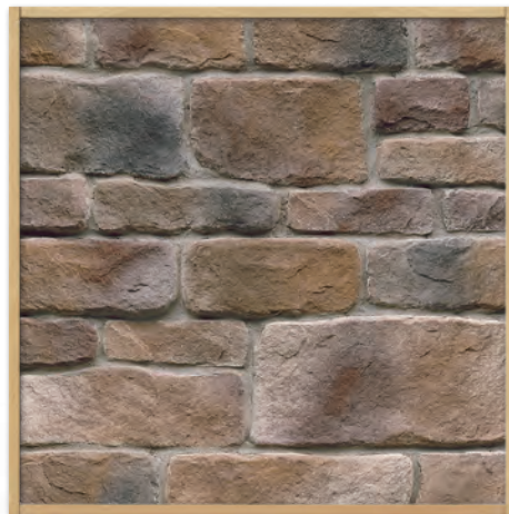
Valley Forge Cobble