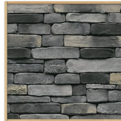
Kingsford Grey Ledgestone