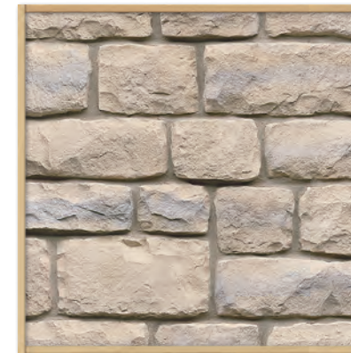
Old Ohio Heritage