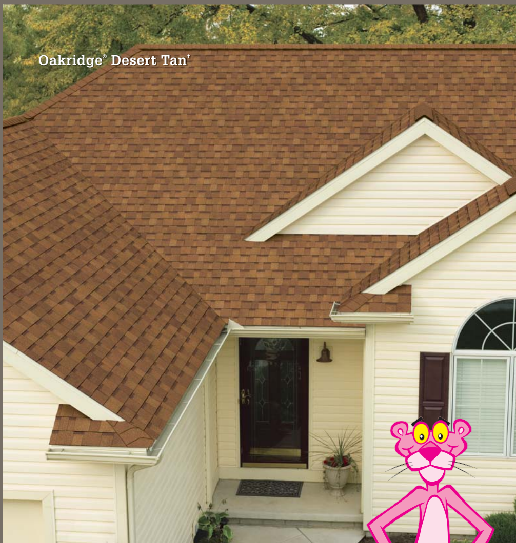
Oakridge® Desert Tan™