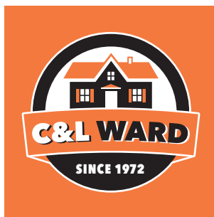
2 Color Embroidery